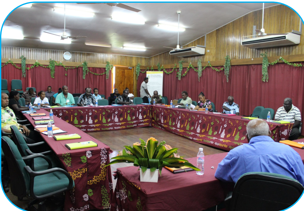
Provincial Participants during the consultation workshop held in Gizo on the Ombudsman Bill in 2015.

Significantly, the Bill seeks to give effect to the Constitutional independence and mandate of the Office of the Ombudsman in a more improved manner; ensure there is continuity in the function of the Ombudsman even in cases where the position of the Ombudsman is vacant; ensure there is more responsiveness on the part of prescribed persons and bodies in relation to implementing the recommendations of the Ombudsman; and provide more transparency, accountability and protection from arbitrary and unfair decisions by prescribed persons or bodies against citizens and residents of Solomon Islands.