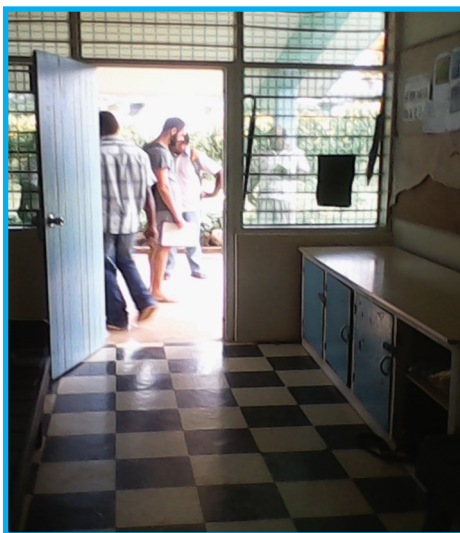
State of the unit when visited in 2015

“The areas of concern are related to staff establishment and skills trainings, maintenance and hygiene, budget constraints, referral progress not practical, and lack of consideration for patients' diets”.