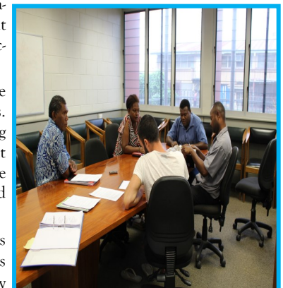
OOSI staff interviewing Official from MEHRD, 2014

Noted that these investigations has not been made public and is treated as confidential. They only become public documents after being table in Parliament.