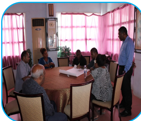
OOSI staff during one of the workshop held at the Jina's conference (Honiara), in a group discussion.

legal advice or opinion on important matters brought to their attention, and in so doing plays a vital role in the way the OOSI perform its functions to serve the citizen of the Solomon Islands.