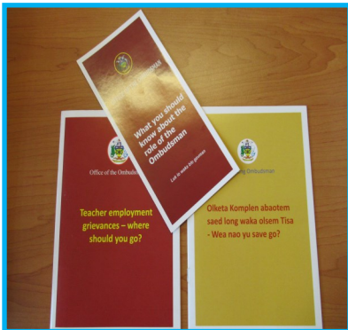
Teachers Complaint Process booklets and brochure

Turning to community outreach, on 10 March 2017, the Office was invited by the Solomon Islands Development Trust (SIDT) to accompany its team that attended the Faumamanu Village Forum in East Kwara'ae, Malaita province. During this forum the Office through its officer had help people to understand the role and functions of the Ombudsman's Office. In response, the community leaders who organized the Forum were delighted to have the Ombudsman's Office representative present at the program.